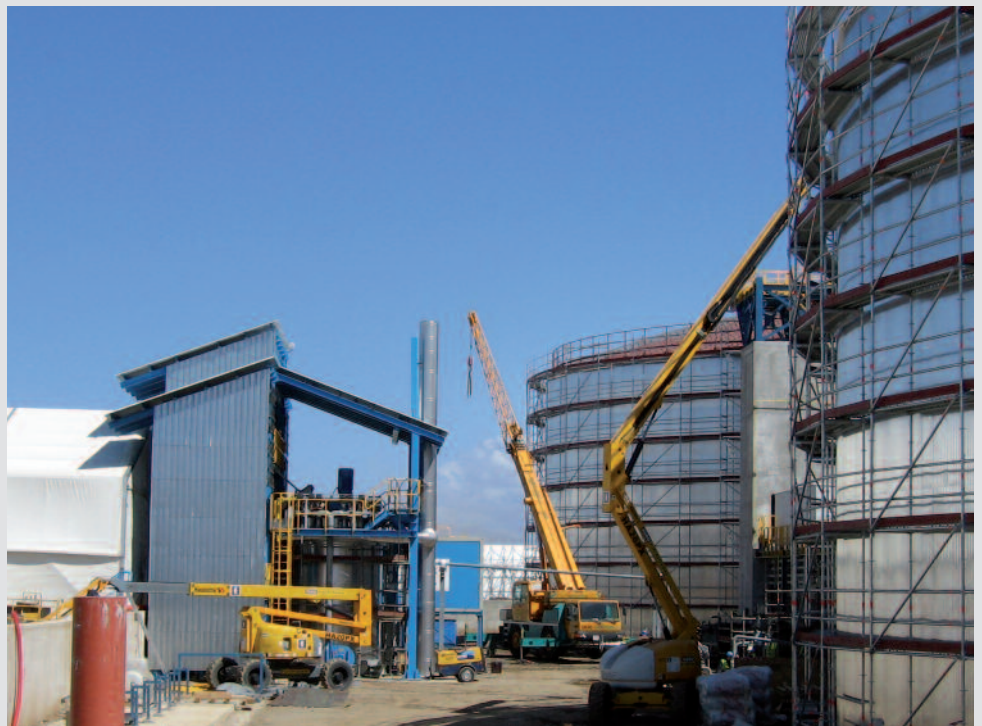
The melting furnace under construction with the two liquid salt tanks which serve as heat storage.

In order to ‘feed’ the melting furnace with a diameter of around 4 metres and a height of 5 metres, every day 13 trucks of raw material from Almeria are required. A buffer store on site with 3.000 tonnes of salt also protects against unplanned